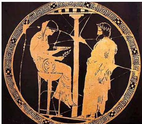
FIGURE 3: Statistician (right) receiving population moments from the Oracle (left).

more-or-less convenient, more-or-less accurate approximation. When we make the stronger assumption that the linear model is right, we will be able to draw stronger conclusions; but these will not be much more secure than that assumption was to start with.