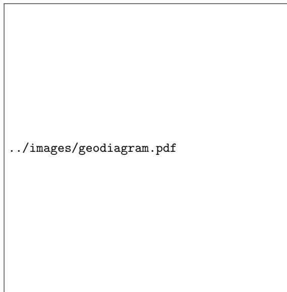
Figure 2: Geographical hierarchy of US regions. Of note, we see that PUMAs and counties do not have a nested relationship, an issue which we handle by using the largest common geography of these two: the census tract.

As illustrated in Figure 5.2.1, there is no direct relationship between PUMAs and counties, and counties are usually the desired input for ABM. This discrepancy between the data highlights the challenge of synthesizing data, even in a highly harmonized place like the United States.