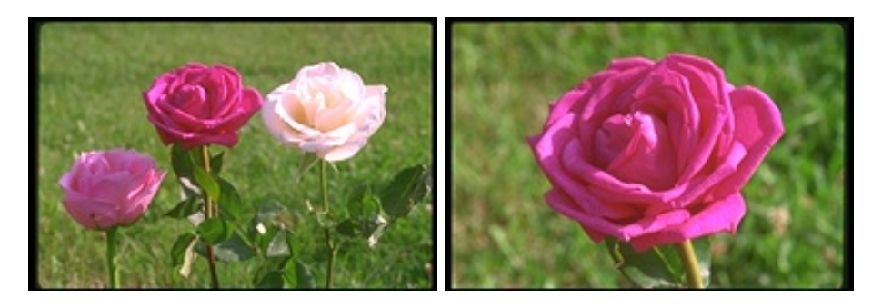
Figure 1: The images flower1 (left) and flower2 (right) from our data set. flower2 is a close-up photo of the middle flower from flower1.

Today's data are photographs of flowers, photographs of tigers, and photographs of the ocean. Table 1 is part of the color-count representation of the data.