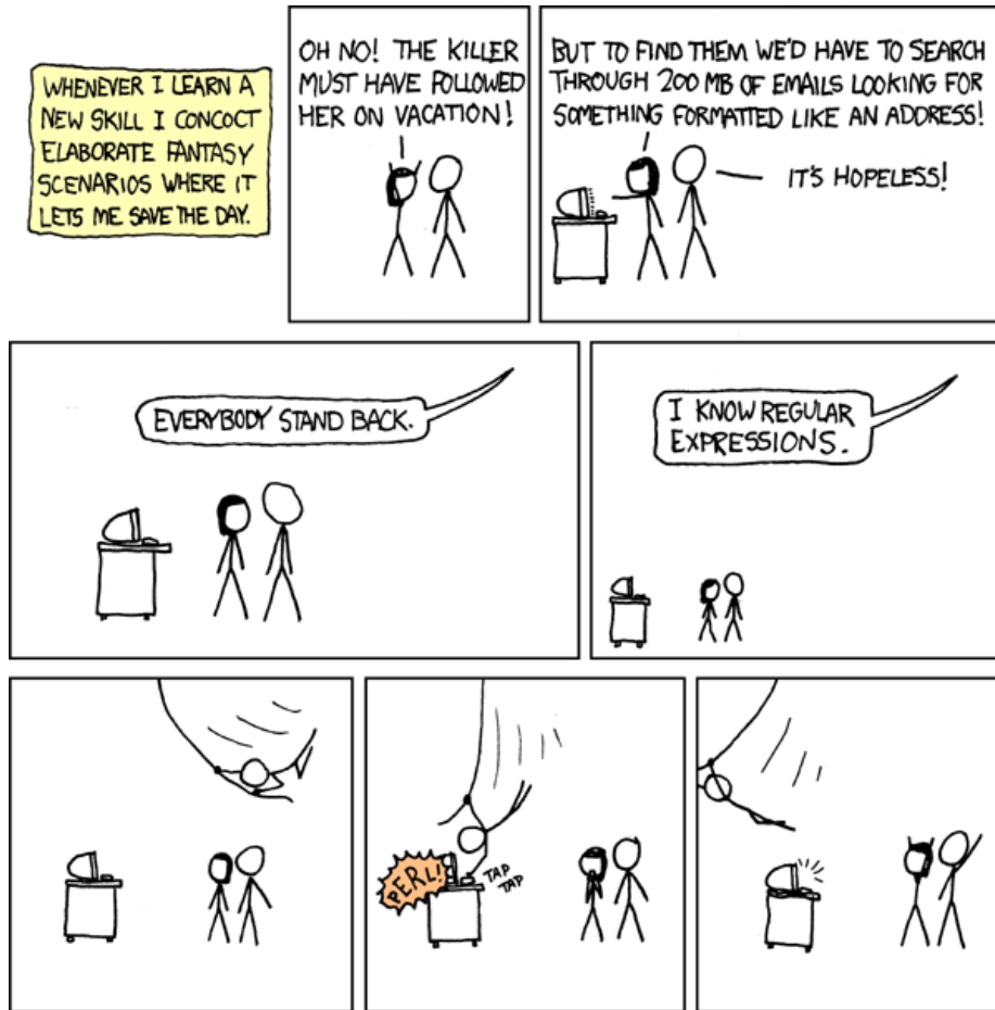
Figure 2: There are many uses for regular expressions; here, they are shown fueling a programmer's fantasy life. (From http://xkcd.com/208/ .)